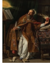
St. Augustine, Bishop and Doctor of the Church.

Our Lady of the Assumption, Pray for us!